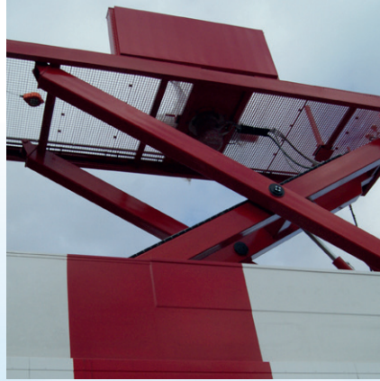
High Stability Scissor Lift