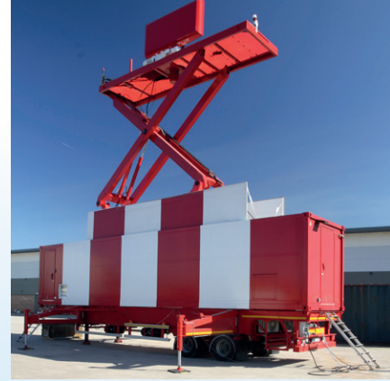
40ft Standard Trailer & Container