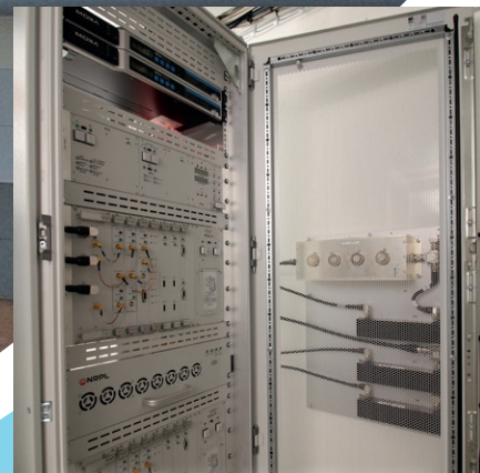
Dual Redundant Mode-S MSSR Interrogator