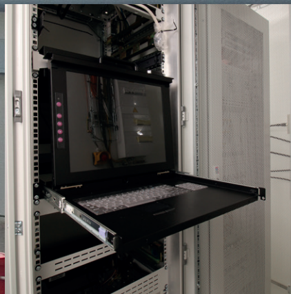
Equipment and Control & Monitoring System (CMS)